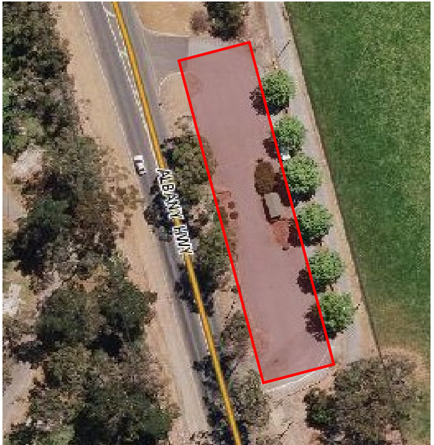
Plantagenet Town Hall car park Maximum of 3 traders

Albany Highway rest stop – Adjacent to Mount Barker Caravan Park Maximum of 2 traders