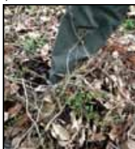
Non-compliant fire fuel load