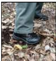
Bush maintained in a hazard reduced state

Bush areas are to be kept in a hazard reduced state. This can be achieved by parkland clearing, mulching or removing dead vegetation, bark, leaf litter etc.