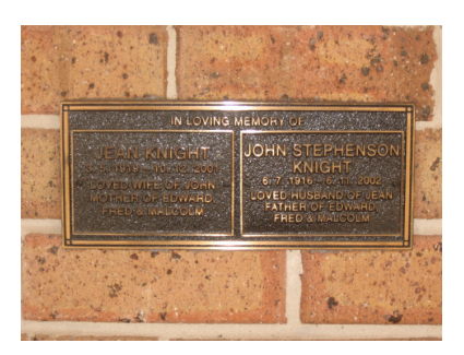
(Double plaques - 125mm x 82mm)