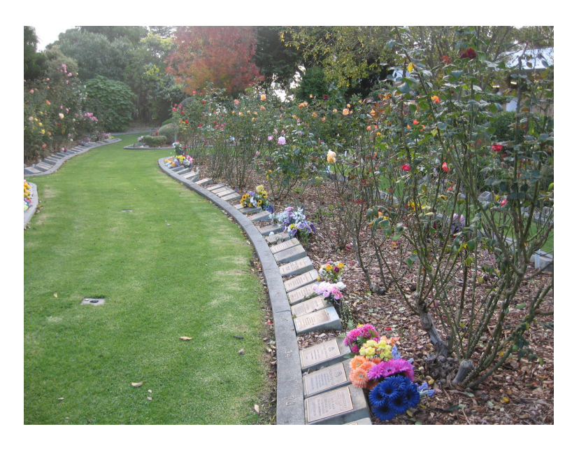
(229mm x 229mm memorial plaques)

Garden ground niche positions and gardens of remembrance are to be nominated for either 229mm x 229mm plaques or 143mm x 117mm plaques, for consistency of appearance.