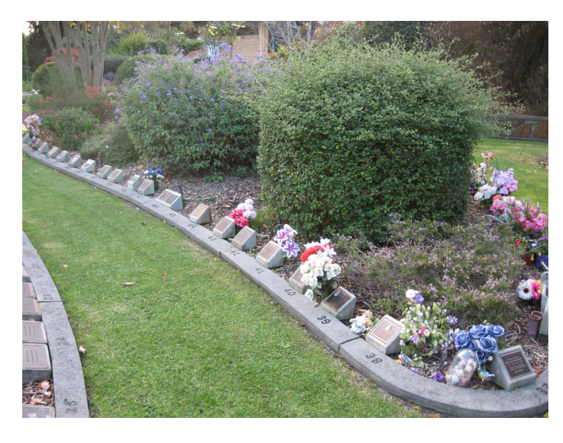
(143mm x 117mm memorial plaques)