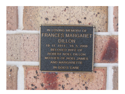
(Single plaques - 145mm x 120mm)