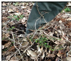
Non-compliant fire fuel load