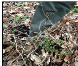
Non-compliant fire fuel load