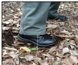
Bush maintained in a hazard reduced state

Bush areas are to be kept in a hazard reduced state. This can be achieved by parkland clearing, mulching or removing dead vegetation, bark, leaf litter etc.