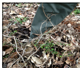
Non-compliant fire fuel load