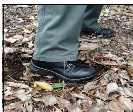
Bush maintained in a hazard reduced state

Bush areas are to be kept in a hazard reduced state. This can be achieved by parkland clearing, mulching or removing dead vegetation, bark, leaf litter etc.