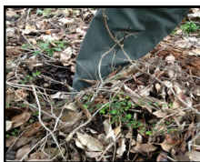
Non-compliant fire fuel load