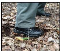
Bush maintained in a hazard reduced state

In addition to the requirements of this notice, where a Fire Management Plan has been prepared and approved as part of a subdivision or development, property owners must ensure their property meets the requirements outlined in the Fire Management Plan. Such subdivisions include (but are not limited to) Mia Flores, Stoney Creek and Braidwood Heights.