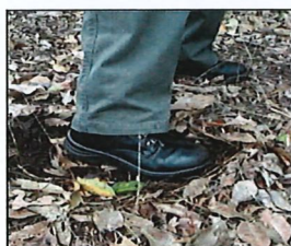
Bush maintained in a hazard reduced state

Bush areas are to be kept in a hazard reduced state. This can be achieved by parkland clearing, mulching or removing dead vegetation, bark, leaf litter etc.