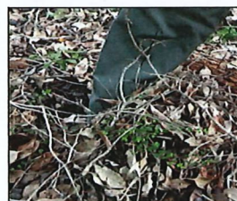
Non-compliant fire fuel load