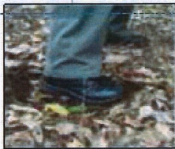
Bush maintained in a hazard reduced state

Bush areas are to be kept in a hazard reduced state. This can be achieved by parkland clearing, mulching or removing dead vegetation, bark, leaf litter etc.