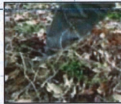
Non-compliant fire fuel load