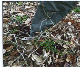
Non-compliant fire fuel load