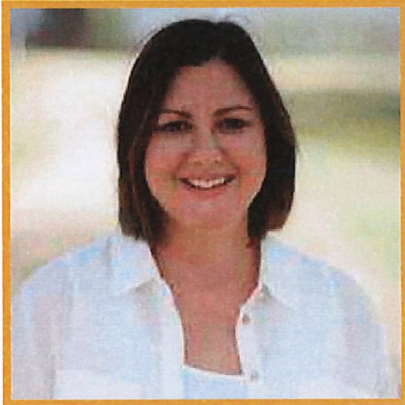
THE HON KRISTY MCBAIN MP

Minister for Regional Development, Local Government and Territories