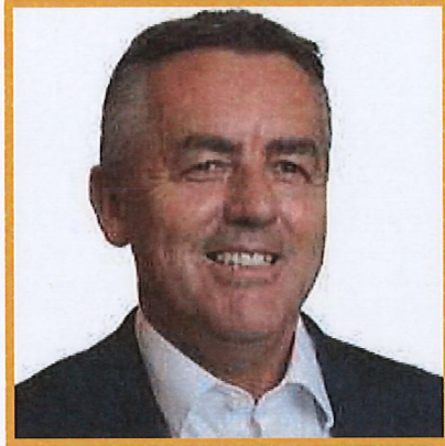
THE HON DARREN CHESTER MP