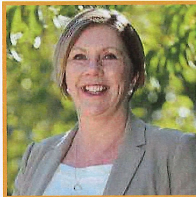
THE HON CATHERINE KING MP (INVITED)

Minister for Infrastructure, Transport, Regional Development and Local Government