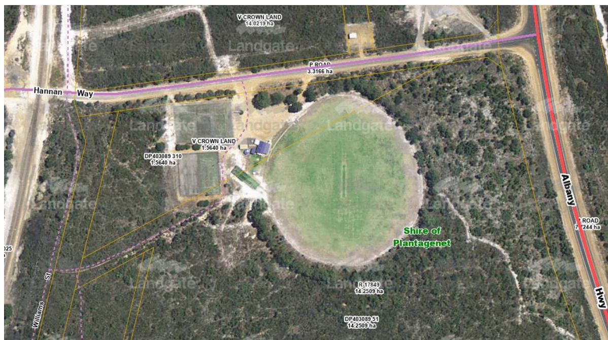
Aerial image of Reserve 17849 and northern portion of UCL, Lot 130 showing Narrikup Sports ground clubrooms and tennis courts.

Various structures, including the tennis courts and clubrooms, have been constructed on the northern portion of UCL, Lot 310, adjacent to Hannan Way. Access is via Hannan Way.