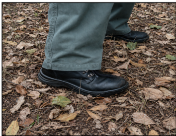
Compliant Fuel Load

Please refer to the below images for depictions of some of the above details.