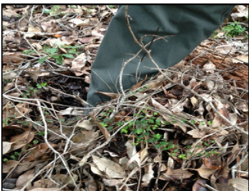
Non-Compliant Fuel Load