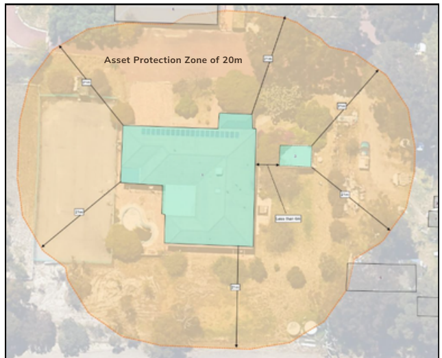
Asset Protection Zone (APZ) shown in orange