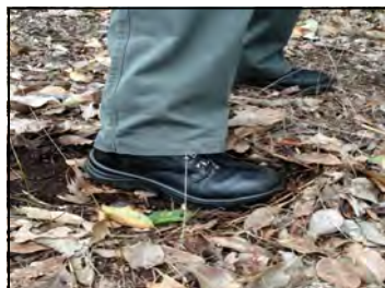
Bush maintained in a hazard reduced state ALL PROPERTIES