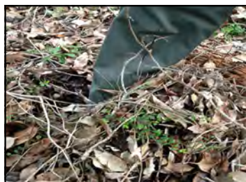
Non-compliant fire fuel load