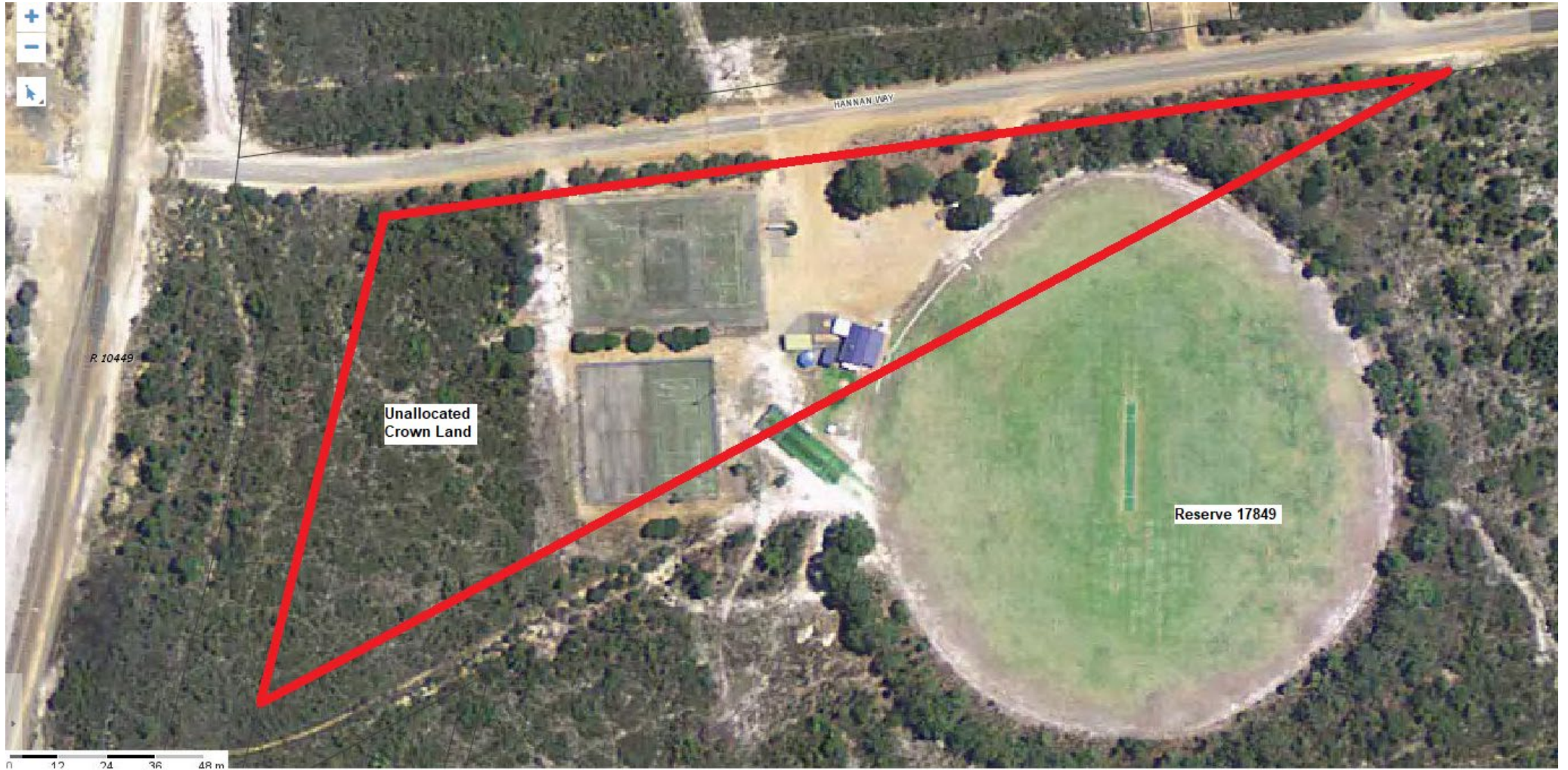
NARRIKUP OVAL AERIAL VIEW – RESERVE 17849 AND UNALLOCATED CROWN LAND