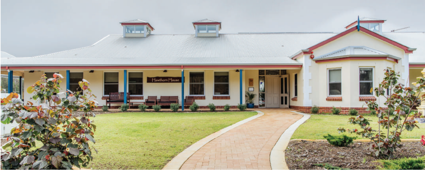
Hawthorn House, Albany

“ We don’t want to mix with just ‘older’ people, we want to mix with younger people too. ”